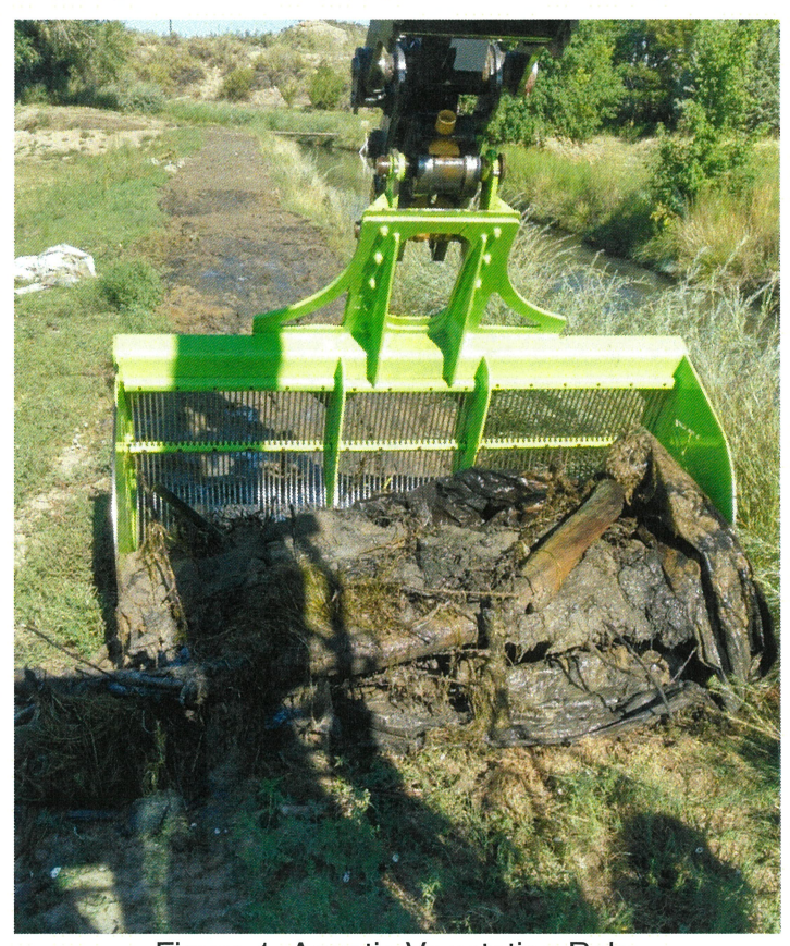
Figure 1. Aquatic Vegetation Rake

The AVR recommended by MWM is specifically designed for use by a CAT 330B/C/D excavator, the long reach excavator most frequently rented by the District. The 8-foot width AVR (1,450 lbs) will come equipped with an A-link Pin-on excavator connection, which is a standard connection size across all excavator manufacturers and used on all CAT long reach excavators. The AVR is also compatible with many different excavator makes and models.