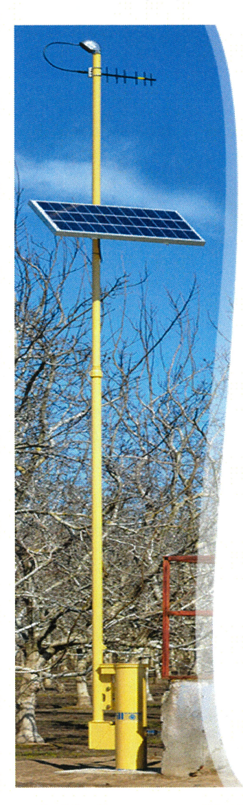
Figure 1. The Sage Designs Pillbox

Staff are recommending the Board approve the expenditure $87,877.41 for the 5 spill sites and a 10% contingency. The total approved purchase limit of $96,665.15 is within the $135,000 project budget.