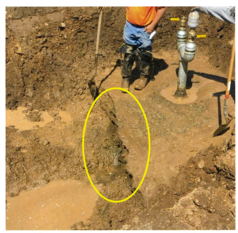
Figure 2. Bellota Pipeline Leak

Staff determined the best solution to repair the 54" Bellota Pipeline leak was to install a new manhole 5' downstream of the leak and repair the crack from the inside. By 4/23/21 District staff installed the manhole and repaired the crack. The pipeline was filled and returned to service on 4/26/21, with no visible leaks. Figure 2 shows the leak and Figure 3 shows the repairs. Staff also excavated the other two potential leaks. The other potential leaks were attributed to a private irrigation pipeline and not the Bellota Pipeline, so no additional repairs were necessary.