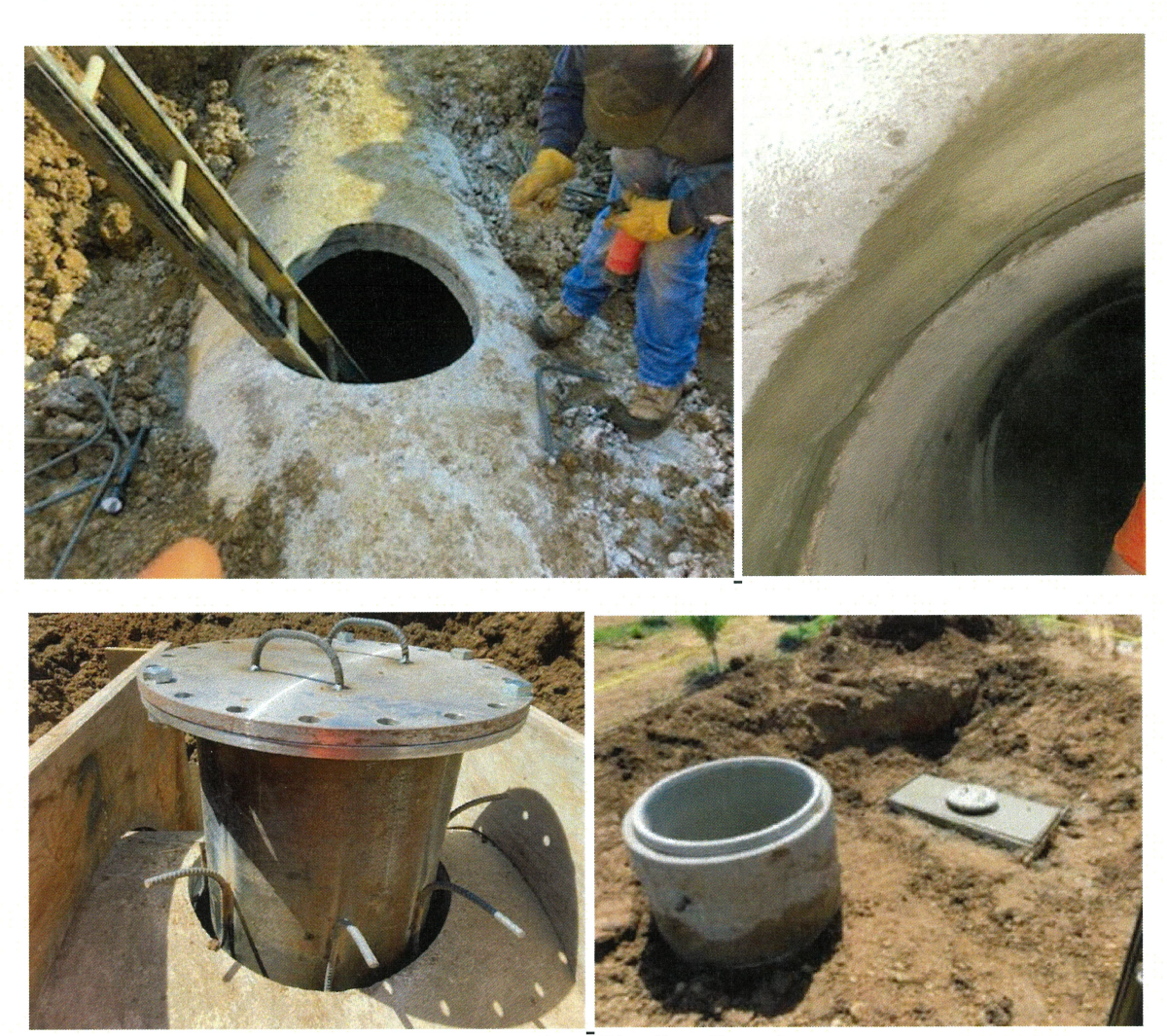
Figure 3. Bellota Pipeline Repair