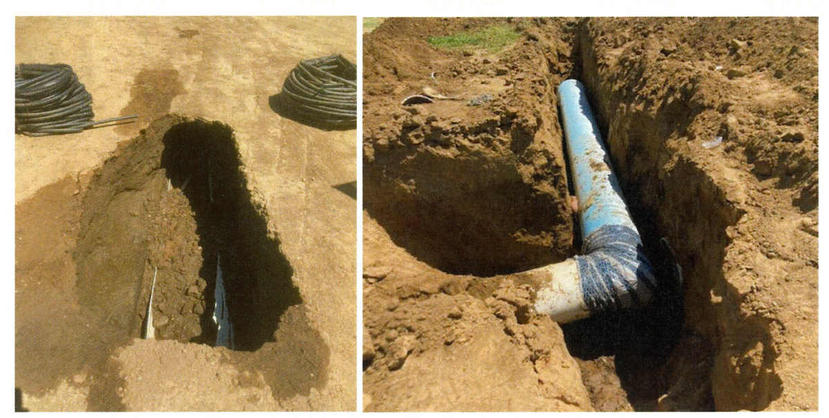
Figure 1. 4,000 Pump Pipeline Leak and Repair

Staff determined the best solution to repair the 54" Bellota Pipeline leak was to install a new manhole 5' downstream of the leak and repair the crack from the inside. By 4/23/21 District staff installed the manhole and repaired the crack. The pipeline was filled and returned to service on 4/26/21, with no visible leaks. Figure 2 shows the leak and Figure 3 shows the repairs. Staff also excavated the other two potential leaks. The other potential leaks were attributed to a private irrigation pipeline and not the Bellota Pipeline, so no additional repairs were necessary.