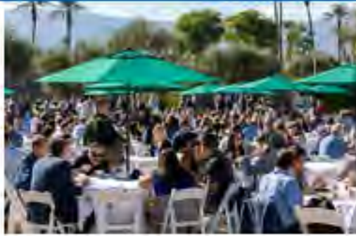
Visit ACWA's Exhibit Hall and learn what products & services our exhibitors have to offer as well as enjoy networking opportunities like the networking breakfast & lunch, receptions and Exhibit Hall activities.

VISIT THE SACRAMENTO SITE FOR CONFERENCE ATTENDEES!