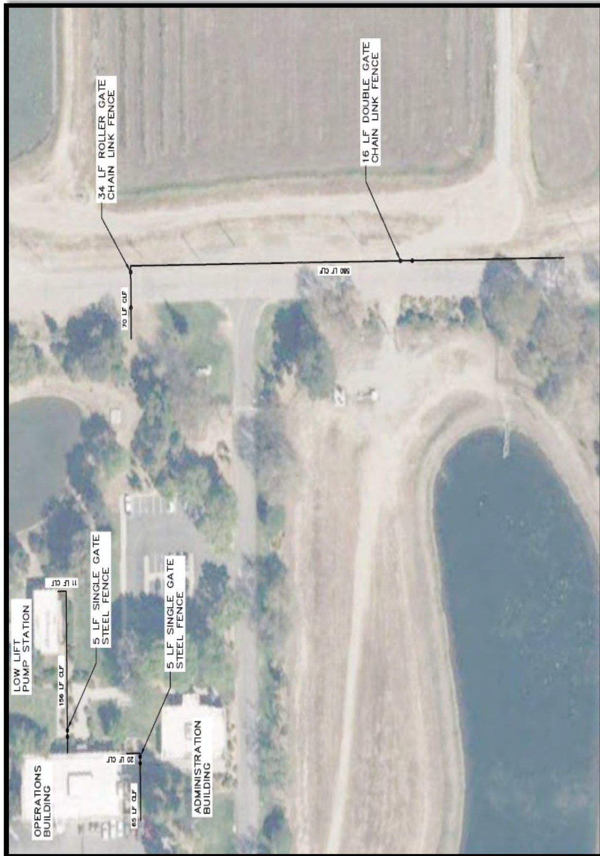
Figure 1. Fence Line