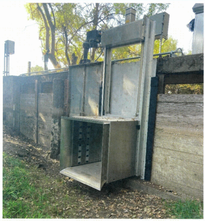
Figure 1: Rubicon SlipMeter at Mosher Creek

The proposed rehabilitation project is located north of Highway 4 on the Lower Farmington Canal. In addition to the ability to accurately measure and control flow, the project will provide the ability to monitor flow remotely and make real-time flow adjustments, thus decreasing repeated site visits for the Water Supply staff. A similar installation was successfully completed at Mosher Creek Headworks. Figure 1 shows the Mosher Creek Headworks SlipMeter.