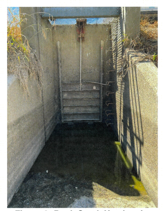
Figure 2: Duck Creek Headworks

The existing structure, which includes a manually operated canal gate, does not currently have flow measurement as shown in Figure 2. Flow measurement and flow control for this site is necessary for SB X7-7 compliance and for delivering water to Central San Joaquin Water Conservation District, respectively.